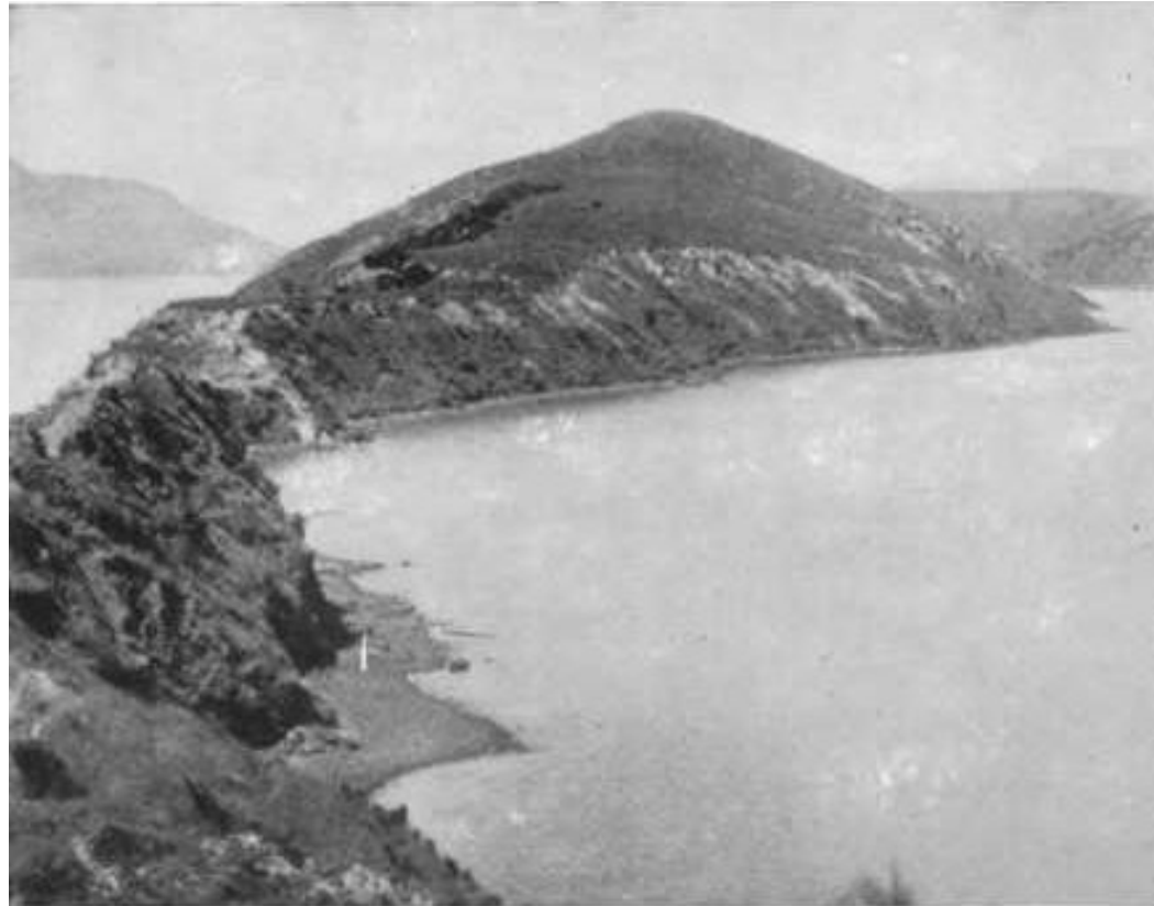
Onawe Peninsula, Akaroa Harbour Pa destroyed by Te Rauparaha.